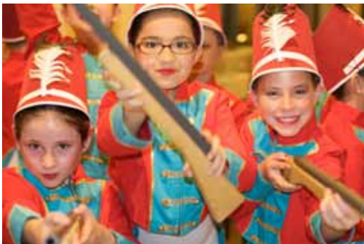
SEDMA students perform as Toy Soldiers in The Nutcracker.